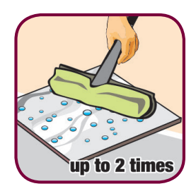
Pretreatment on all sides

to prevent efflorescence and stains, no problems with grouting and jointing residues, no intrusion of moisture, no water stains, vapour permeability granted.